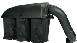
TRIPLE BAGGER NX15 19A30018100