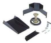
QUICK HITCH WITH DRIVE 196-602-000