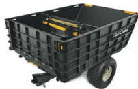
HAULER TRAILER 19B40026100R