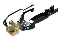
QUICK HITCH W/O DRIVE 196-601-000