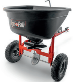
SPREADER MEDIUM 196-545-000