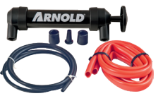
OIL EXTRACTION PUMP 6011-U1-0001