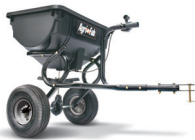
SPREADER SMALL 196-031B000