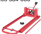
CLIP LIFT 6031-X1-0013