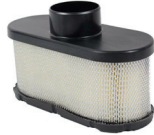
AIR FILTER KM-023439 (11013-0752)