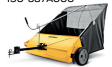
SWEEPER 112 CM CUB CADET 196-543-000