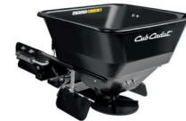
ELECTRIC SPREADER NX15 19A30028100