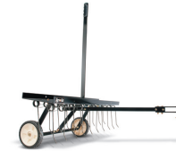
TINE DE-THATCHER 101,6 CM 190-526-000