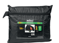
PROTECTION COVER 2024-U1-0004