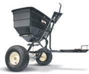
SPREADER LARGE 196-036-000