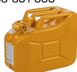
FUEL CAN CC 10L 196-558-603