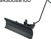
DOZER BLADE 46"/117CM STD 19A300170EM