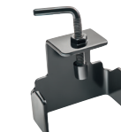
BLADE REMOVAL TOOL 6011-X1-0757