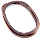
DECK BELT V TYPE:BSEC X 134" 754-04077A